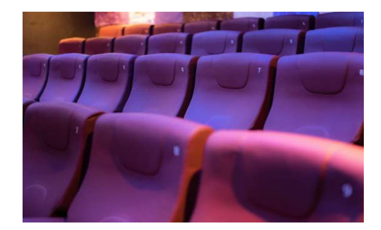
Jam Jarr Communitary Cinema - North Tyneside, UK

This product allows the use of upholstery woven with polyester yarns made from recycled PET bottles.