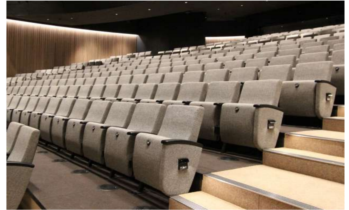
Shirley Burke Theater- Parkdale, Australia

This product allows the use of upholstery woven with polyester yarns made from recycled PET bottles.